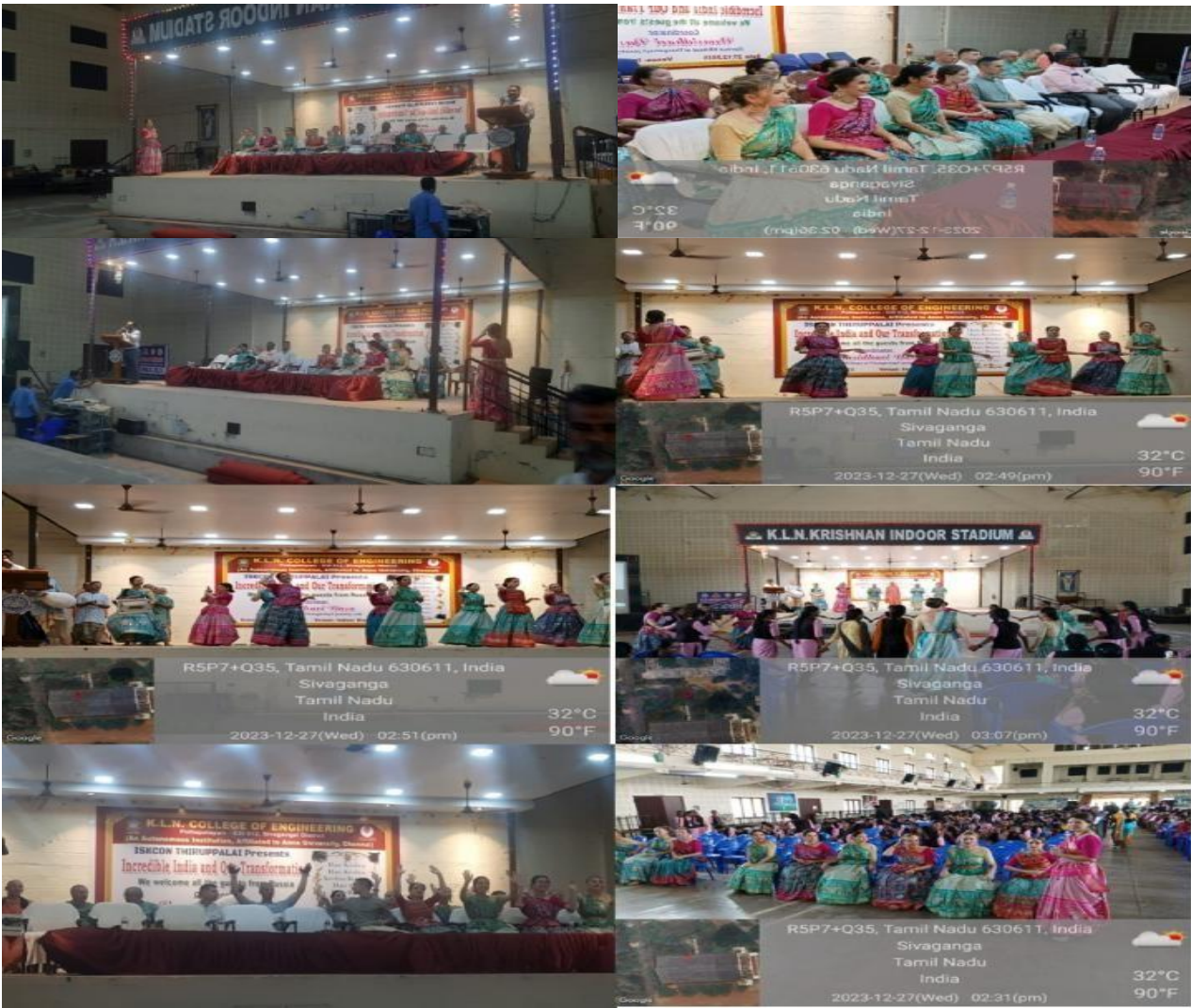
10. Cultural and Literary Association of KLNCE has organized the program “TIMES OF ADITHYA” for All UG Cultural Students (45 Students performed) on 27.02.24.