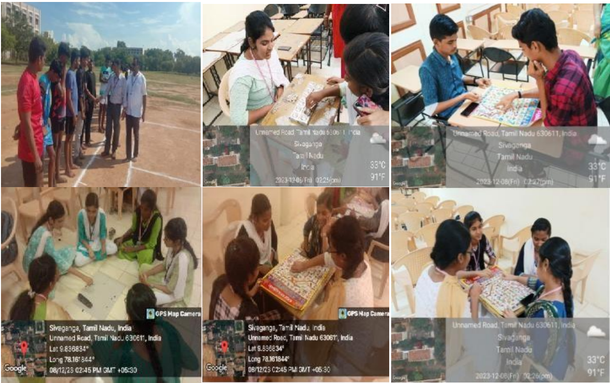
9. Cultural and Literary Association of KLNCE has organized the program “INCREDIBLE INDIA” for First year 450 UG students on 27.12.23.