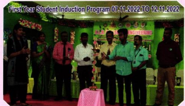
First Year Student Induction Program 07.11.2022 TO 12.11.2022

A STARTUP ECOSYSTEM - K.L.N. Innovation & Research Park Inaugurated during Feb - 2023 @ KLNCE Campus