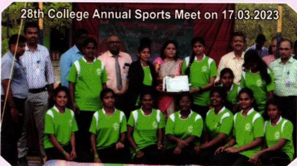
28th College Annual Sports Meet on 17.03.2023